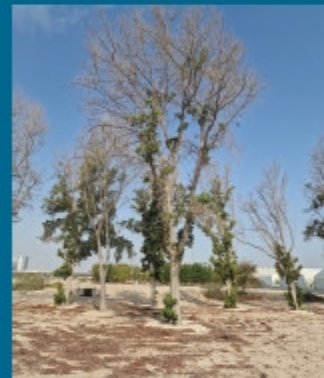
What happens when trees are irrigated, then it is switched off, roots have no resilience.