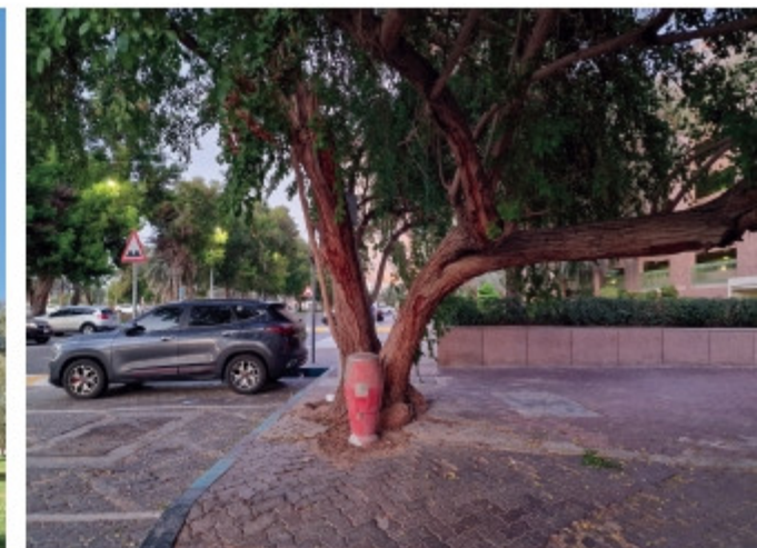
When trees like this sīdr are paved around and have no open soil, it's no wonder they seek out drains.

First, what is a phytobiome? A phytobiome consists of a plant (phyto) situated in its specific ecological area (biome), including its environment and the associated communities of organisms which inhabit it. These organisms include all macro- and micro-organisms living in, on, or around the plant including bacteria, archaea, fungi, protists, insects, animals, and other plants.