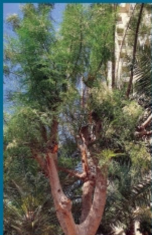
Moringa oleifera – a tree of multiple uses, which adds to urban ecosystem creation.

fungi up to 20% of their photosynthate, in return for water and nutrients which the mycorrhizae find, often far beyond the reach of tree roots. This is the main reason why we should NOT add fertilizer to soils, for it bypasses this symbiosis and diminishes the fungal relationship, especially for phosphorous accumulation.