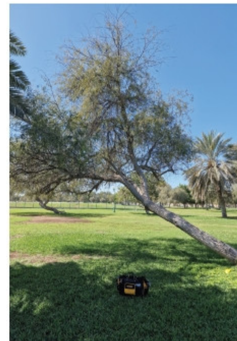
Over-irrigated ghafl trees are easily wind-thrown as they have few deep roots.

There is a growing awareness that trees help mitigate climate change, but the conversations are mostly limited to carbon sequestration, when that is only one of the benefits. We also know that trees add shade and transpiration, making streets cooler, yet even that is not the whole picture. It's time we understood trees as phytobiome generators, rather than just as shade/beauty structures spaced along a pavement.