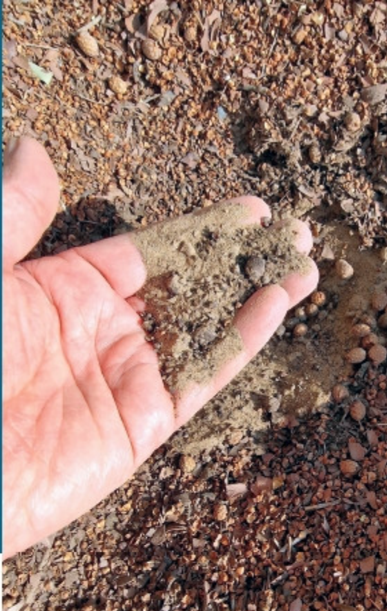
Trees will generate their own mulch from leaf litter. This is an essential part of soil-building.