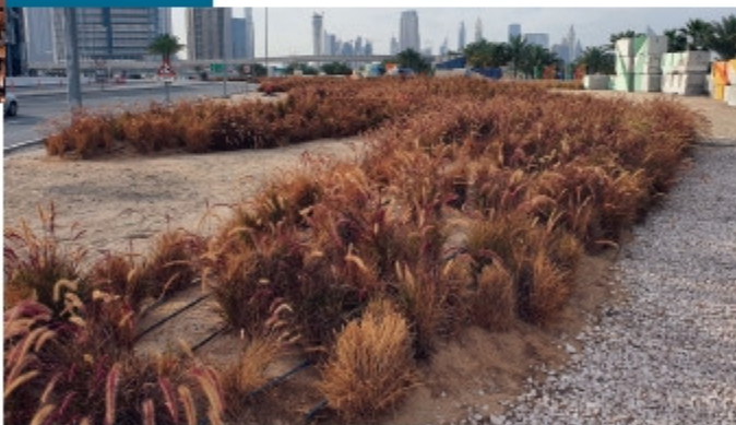
Monoplanting of species does little for ecosystem generation

To understand this reasoning, we must acknowledge that the world has become fixated on carbon emissions as the driver of climate change, whilst ignoring the equally important impacts degradation of soil health and local water cycles have. For the past 12,000 years we have been removing trees, disrupting water cycles and dehydrating the land, which is increasing at an exponential rate.