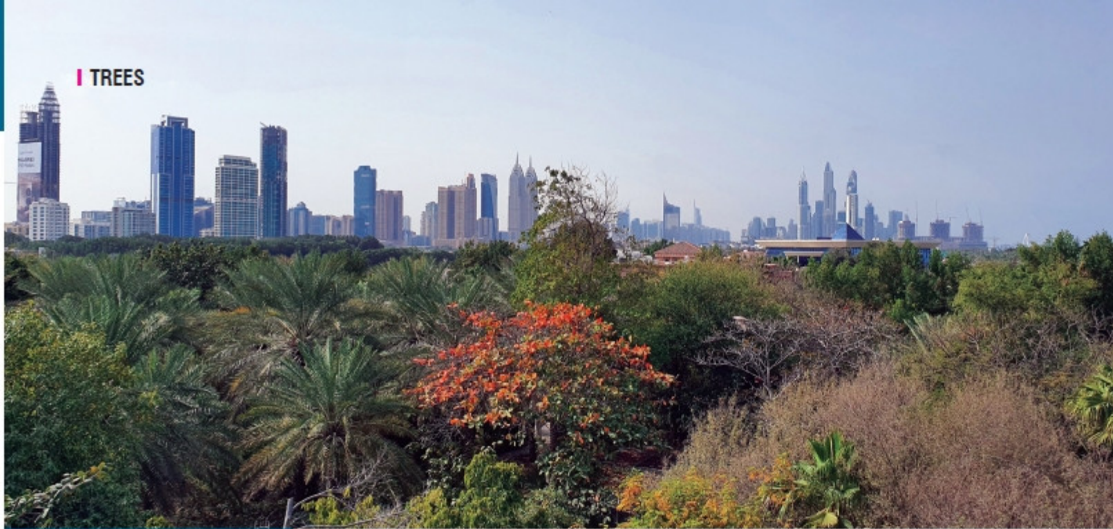
A rare view of urban forest in Dubai, everywhere could look like this.

Planting trees in paving or irrigated lawns won't mitigate climate change; we need to shift our design principles and practices to make a difference