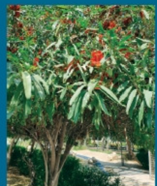
Tecomella undulata is a rarely planted UAE native

Over 90% of trees have root associations with mycorrhizal fungi (many of them are obligate – essential to survival), and this is true even in the desert. There is limited research on this, but wild plantings of regional natives and date palms have been shown to have these active relationships. For landscape plants, creating the soil conditions mentioned above will allow mycorrhizae to thrive but we may have to inoculate the area with local strains taken from healthy soils. A tree will give these