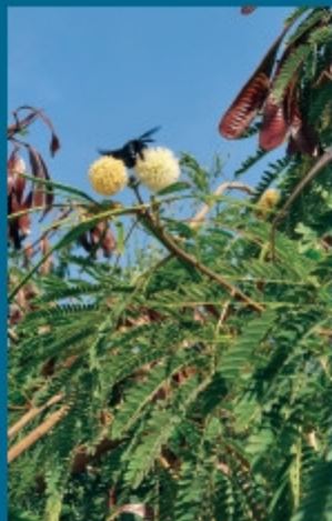
Leucaena leucocephala attracts wildlife, such as this carpenter bee.