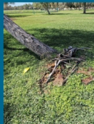
Over-irrigated ghaif trees are easily wind-thrown as they have few deep roots.

We need to mulch beds with woodchip, preferably Ramial Chipped Wood (produced from small branches with a higher nitrogen and cambial content). This again can be made from local green waste and arisings, even from the landscaped areas themselves, especially if a coppice-landscape approach is used (the subject of another article). Mulches oxidize quickly in the heat, so need regular top-up, but they keep moisture in the soil and feed microbial activity; no mulch, no soil life. Ornamental stone mulches of the wavy black/white areas so often seen, should be relegated to past mistakes, though natural stone mulching may be appropriate in some xerophytic plantings. The aim is to reverse the excess of transpiration over infiltration.