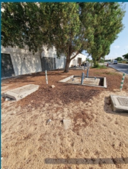
Self-generation of mulch and living soil under this Conocarpus . Maintenance has not failed this way.