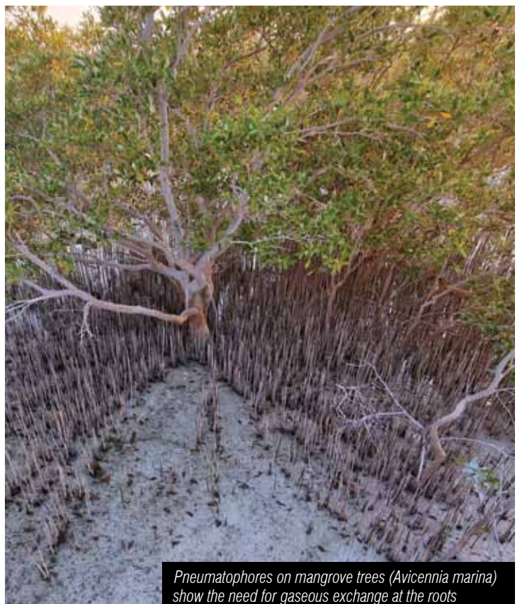
Pneumatophores on mangrove trees (Avicennia marina) show the need for gaseous exchange at the roots

We traditionally think of soil in terms of structure (texture), chemical (nutrient) makeup and organic matter. These are the factors that horticulture deals with but what is missing is the most vital ingredient – life. The soil is – or should be – a living biosphere, a soil food web. The region around roots is called a rhizosphere. Traditional thought is that life in soil equals pests, such as fungi, nematodes or bacteria, but nothing is further from the truth. In fact, the more life soil has, the fewer problems, for the benign life (which is the majority) holds the negative aspects in check. Bad things run riot only when the ecosystem is out of balance.