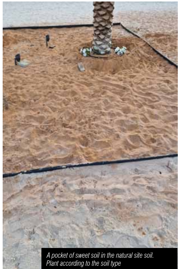
A pocket of sweet soil in the natural site soil. Plant according to the soil type

Finally, place a good layer of organic mulch over the CRA, or wider if possible. This can be quite deep, 100mm or so (not placed against the tree trunk though). And will help prevent evaporation and keep the soil cooler, whilst providing a food source for all the soil microbiology – and so indirectly, for the tree. Feed the soil, not the tree. My previous article (November 2023) talked of how we can utilize our landscape material (coppiced material, or arisings) to generate local mulch.