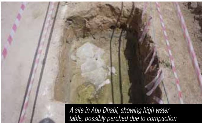
A site in Abu Dhabi, showing high water table, possibly perched due to compaction