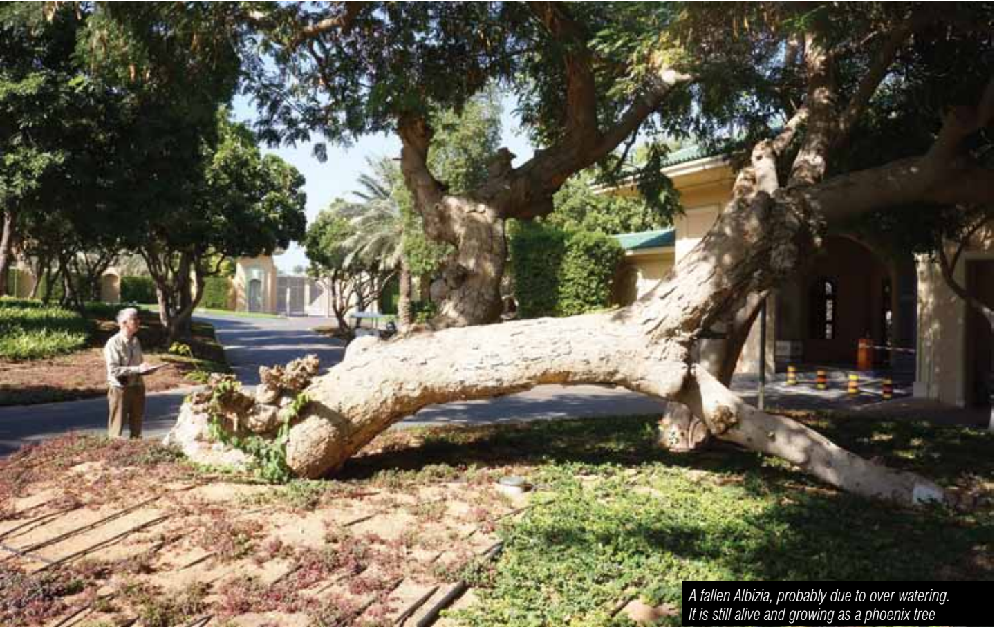
A fallen Albizia, probably due to over watering. It is still alive and growing as a phoenix tree