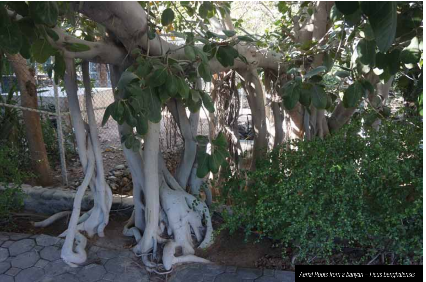
Aerial Roots from a banyan – Ficus benghalensis

Trees are a bit like icebergs – there’s much more underground than meets the eye. Not so much in physical size perhaps, but in importance; if you want a healthy tree, you need healthy roots and so must have healthy living soil. Most urban trees don’t have that so it is essential to understand why and what we must do.