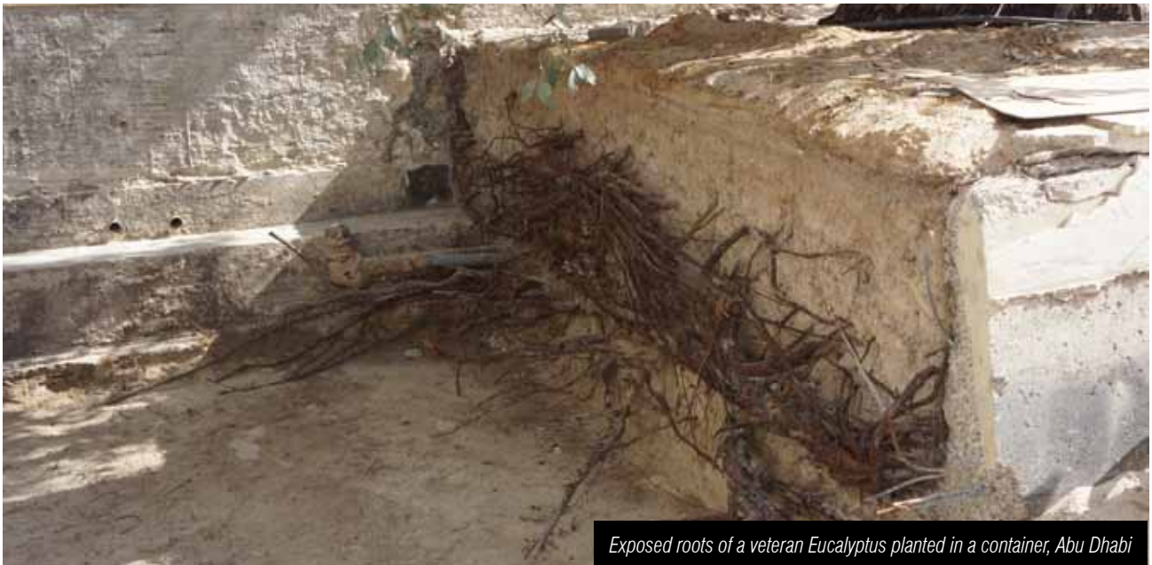
Exposed roots of a veteran Eucalyptus planted in a container, Abu Dhabi

Soil life consists of many forms, including bacteria, protozoa, nematodes, fungi and microarthropods. One of the most important is mycorrhizal fungi. These form symbiotic relationships with trees and are obligate – necessary, not optional - for over 90% of plants and trees. A sterile or imported soil will have no natural source of these, and adding a packet of mycorrhizal fungi into a planting mix will solve nothing – many such relationships are region and species specific. They are important