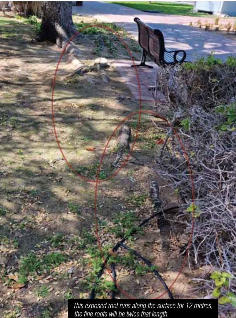
This exposed root runs along the surface for 12 metres, the fine roots will be twice that length