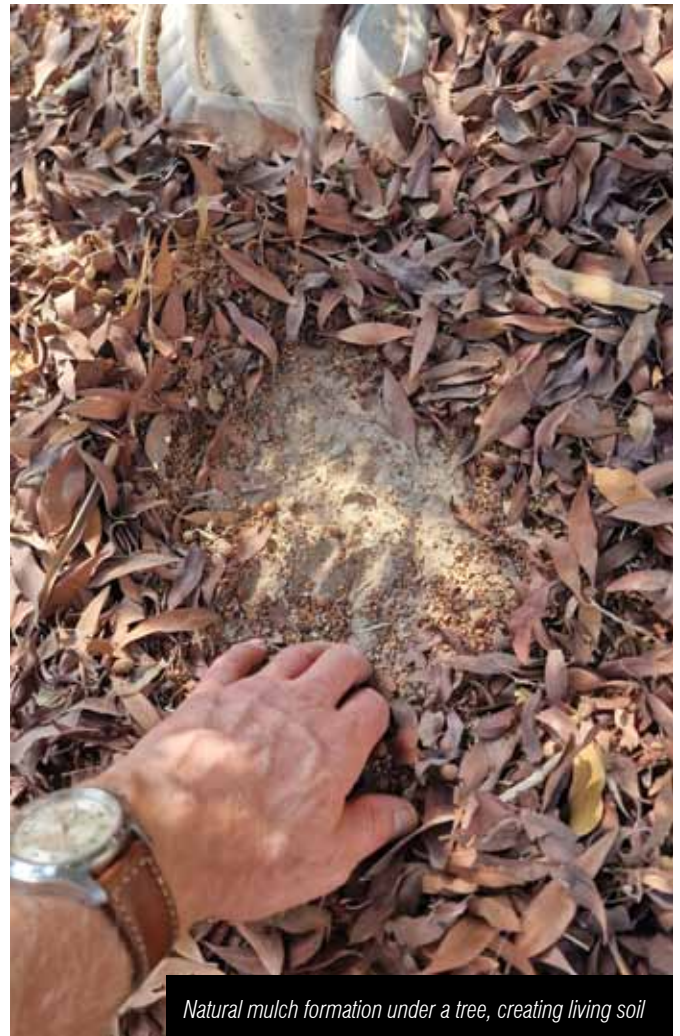
Natural mulch formation under a tree, creating living soil

salinity but will be devoid of any meaningful microbiome, especially suitable mycorrhizae. With little biological process occurring, the organic matter soon oxidizes away. Adding fertilizer just compounds the problem as this has an inhibitory effect on mycorrhizae as the tree no longer signals its needs. It's better to work with existing soils, plant species that cope with the conditions and develop a dynamic soil food web. Salinity can be managed by species, healthy soil (mycorrhizae help manage salinity), correct irrigation regime and mulch.