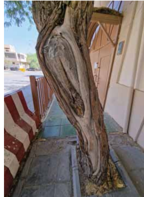
Some trees survive, despite all that is wrong

need a good root system yet are in a too-small container, likely to have circling roots if not correctly pruned and repotted. Finally, if the tree does not have, from the supplier, the right branch structure, this can't be altered and what formative pruning could be done is often ignored, or more likely, not perceived as necessary. Straight away, production has limited and sometimes negated the end required result; such trees don't have a high rate of survival. There is also a large risk of importing exotic diseases from the place of origin.