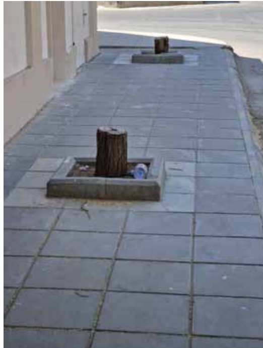
The inevitable consequence of poor design