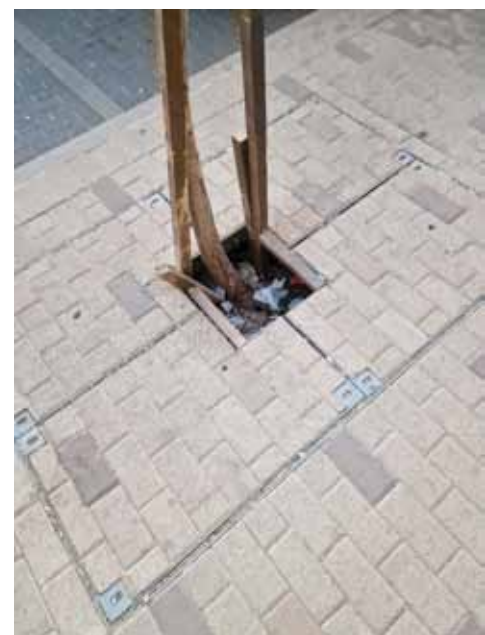
Poor plant pit design, staking and poor nursery stock leaves little chance of survival