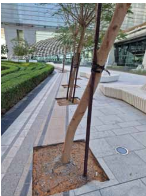
These trees are poorly staked and have no stem taper with a crown formed by heading cuts

The result is often that trees are grown very close together with rootballs that are too small (to keep transport weight down). Competition for light in dense rows forces upright growth with few side branches and little or no stem taper. This is important because the trees are being grown (in essence) as a crowded forest tree while the end requirement is generally for a tree with an open, full canopy. Such trees need good stem taper and a sound branch scaffolding to become good specimens. They also