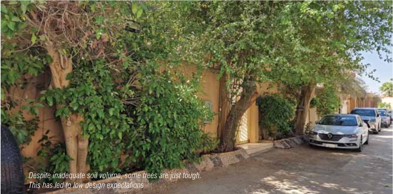
Despite inadequate soil volume, some trees are just tough. This has led to low design expectations