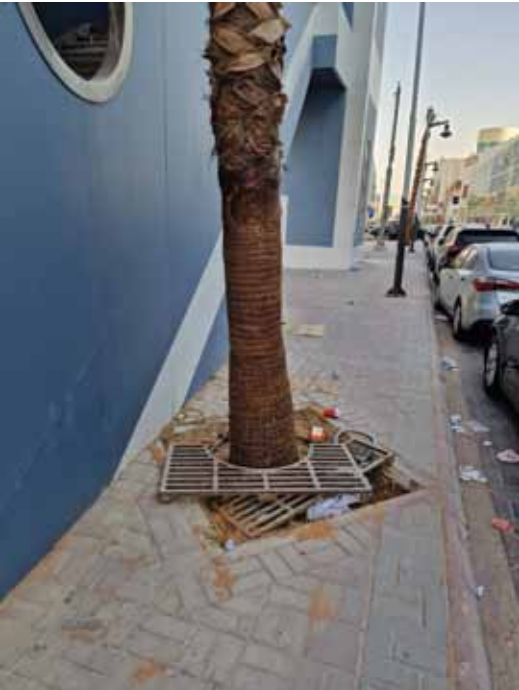
Palms may need less root volume, but this is poor placement and design