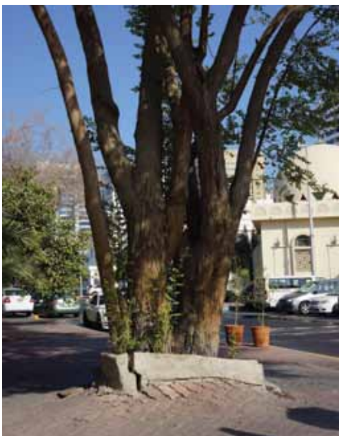
Trees like Ziziphus are street survivors - with extensive root systems

that and this is known as SUDS, sustainable urban drainage systems. During the recent storms many trees were blown over, revealing inadequate root systems and insufficient root space (see pic). This is also a problem exacerbated by excessive, shallow irrigation. Over-irrigated trees don't need deep roots to find water. Look at the number of ghaf trees in irrigated landscapes which are severely leaning, compared with those you find in the desert. The winds are the same, the water availability is what's different.