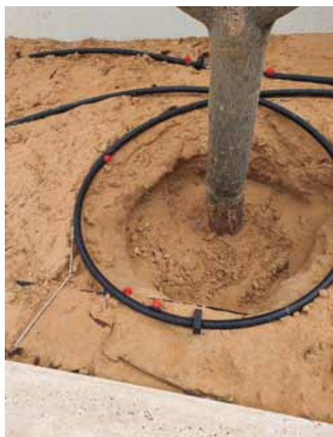
This frangipani has been planted at least 30cm too deep. Don't bury the root flare