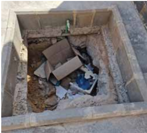
Would you want to live in there? No room for a tree